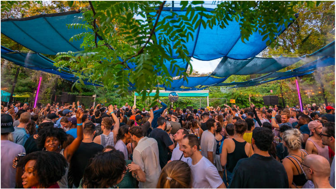
Mister Sunday. "The Mister Sunday Guide" Time Out Magazine, August 20, 2021.